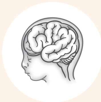
39 to 40 weeks